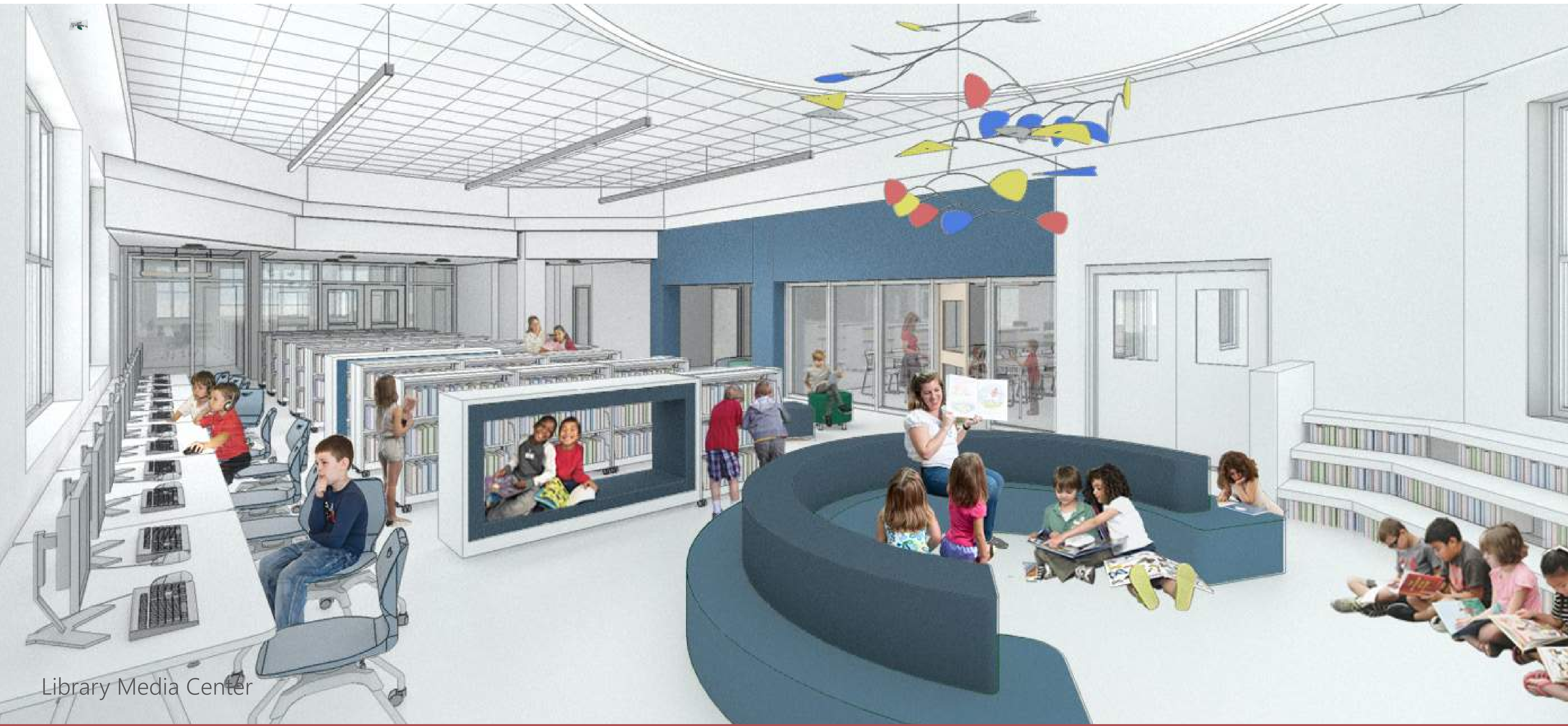
Library Media Center